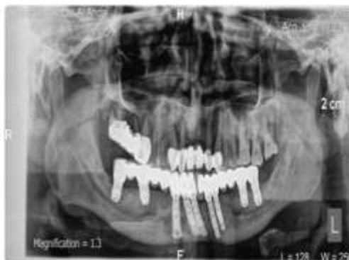
Figure 3: Immediate postoperative panoramic radiograph Figure 4: Three months postoperatively