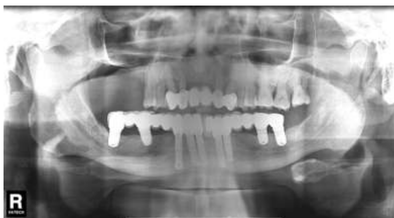
Figure 5: Postoperative panoramic radiograph (two years after loading)